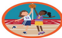
Competition with teams from your area