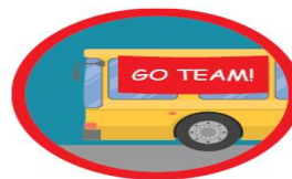
Full competition from different areas