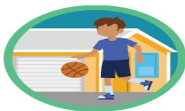
Skill-building drills at home